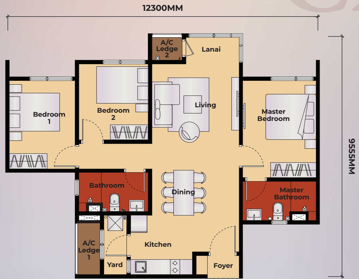
Type C2 (3R + 2B) 904 sqft | 84 sm