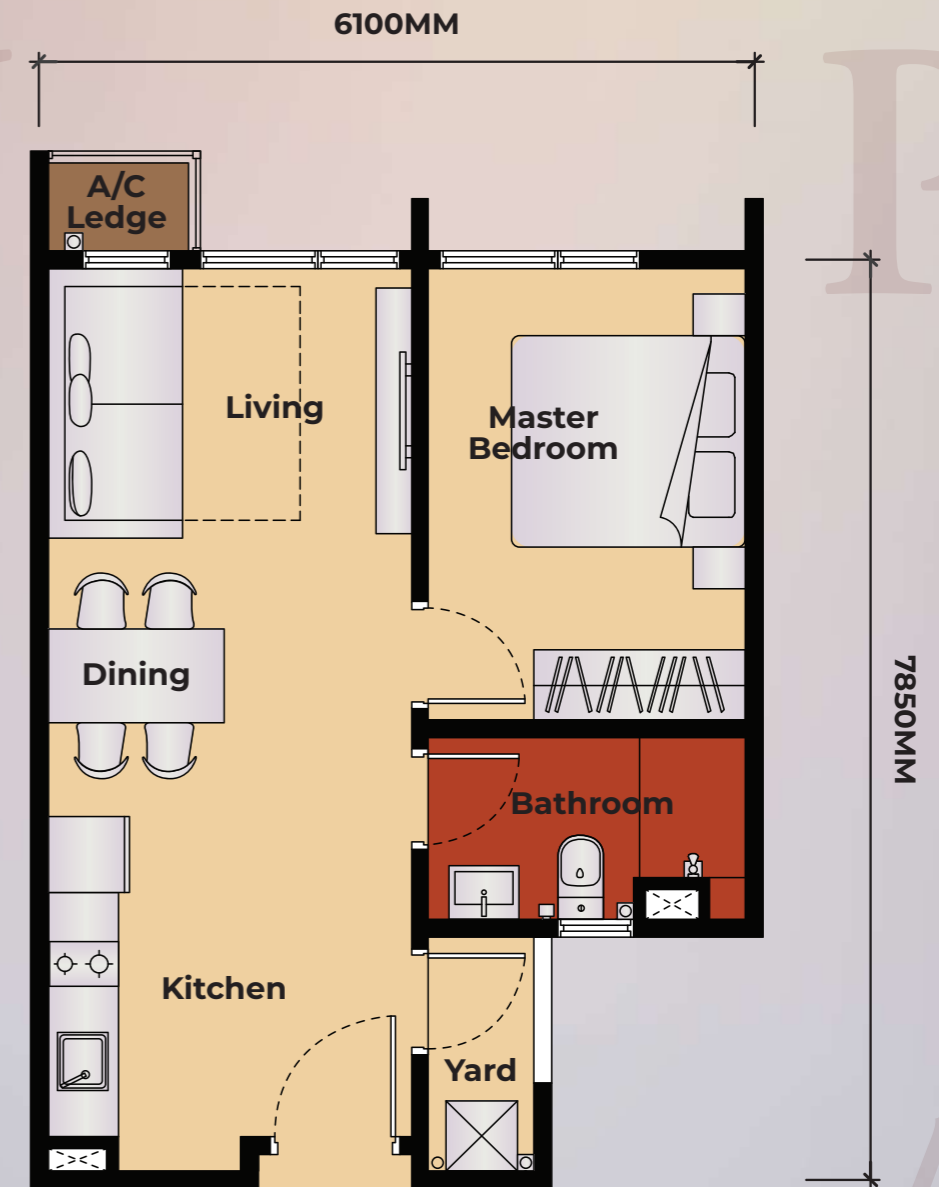
Type A1 (1R + 1B) 474 sqft | 44 sm