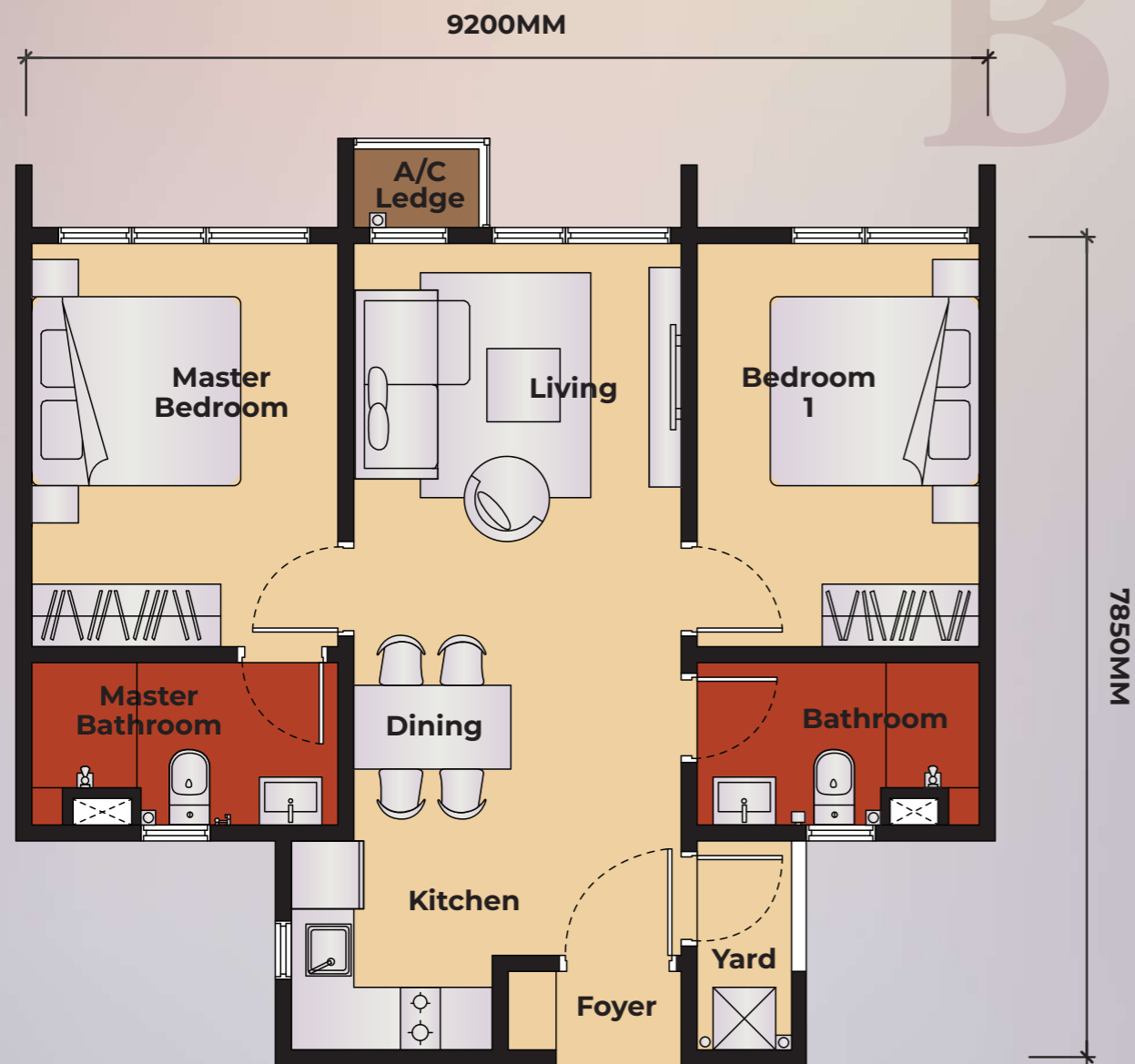
Type B1 (2R + 2B)