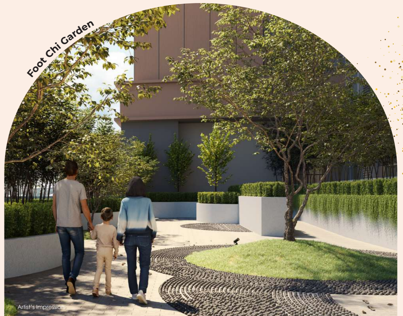
Foot Chi Garden