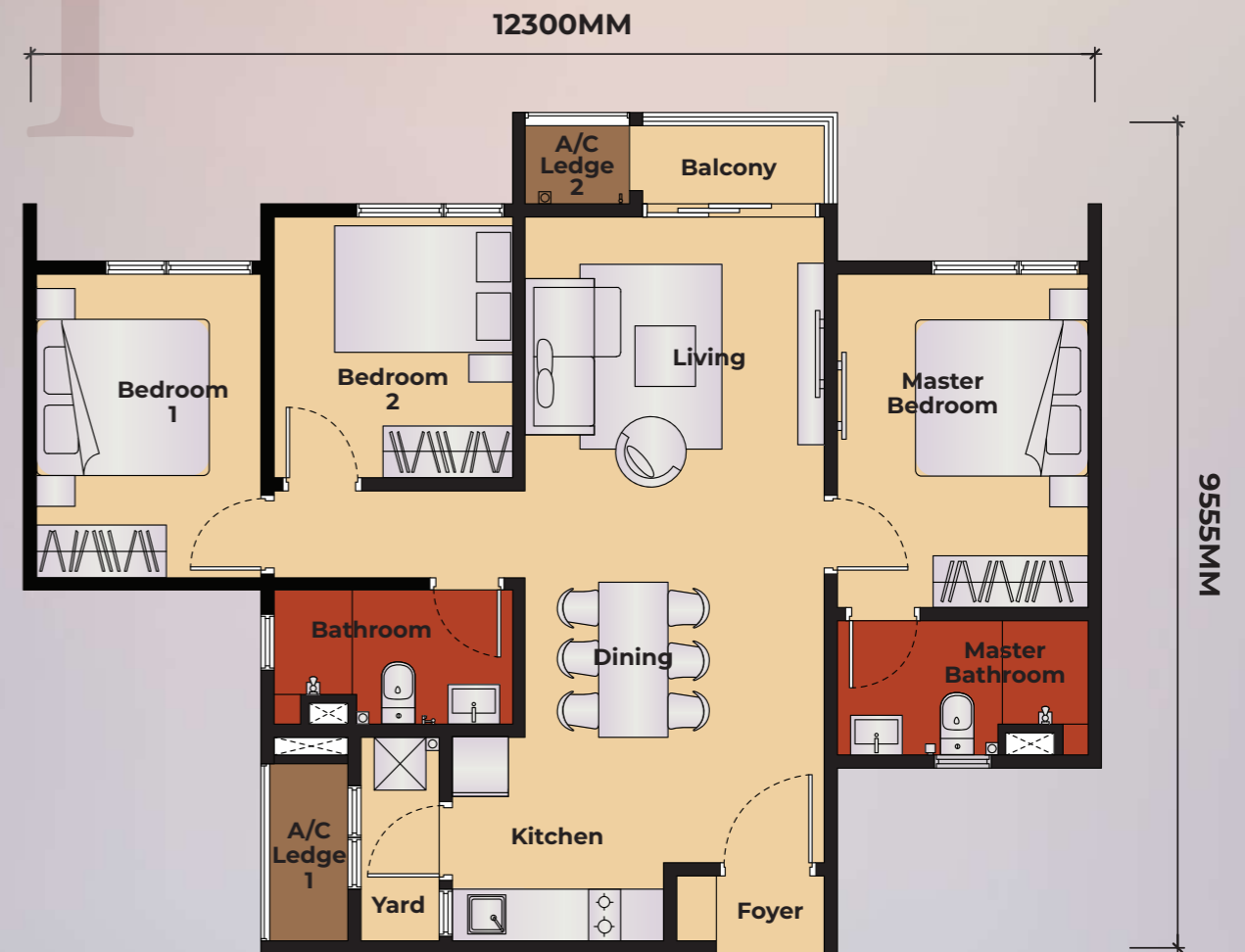
Type C1 (3R + 2B)