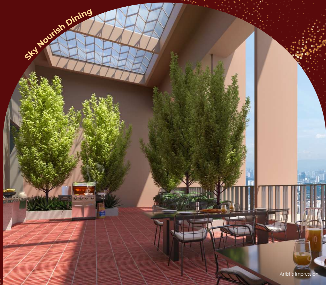
Sky Nourish Dining

The eighth-level private garden at The Kingswoodz @ Bukit Jalil is a true gem. With cozy seating areas for relaxation or yoga, it's your personal oasis. Walk along the covered path and discover a charming Biopond next to the Azure Bliss Pool. Lush greenery and colourful trees surround you, offering a reflexology garden (Foot Chi Garden), outdoor workout area (Outdoor Vitality), Lush Lawn, and community farm (Greenery Galore). Enjoy breathtaking views from the vine-covered King's Pavilion ideal for gatherings or quiet contemplation.